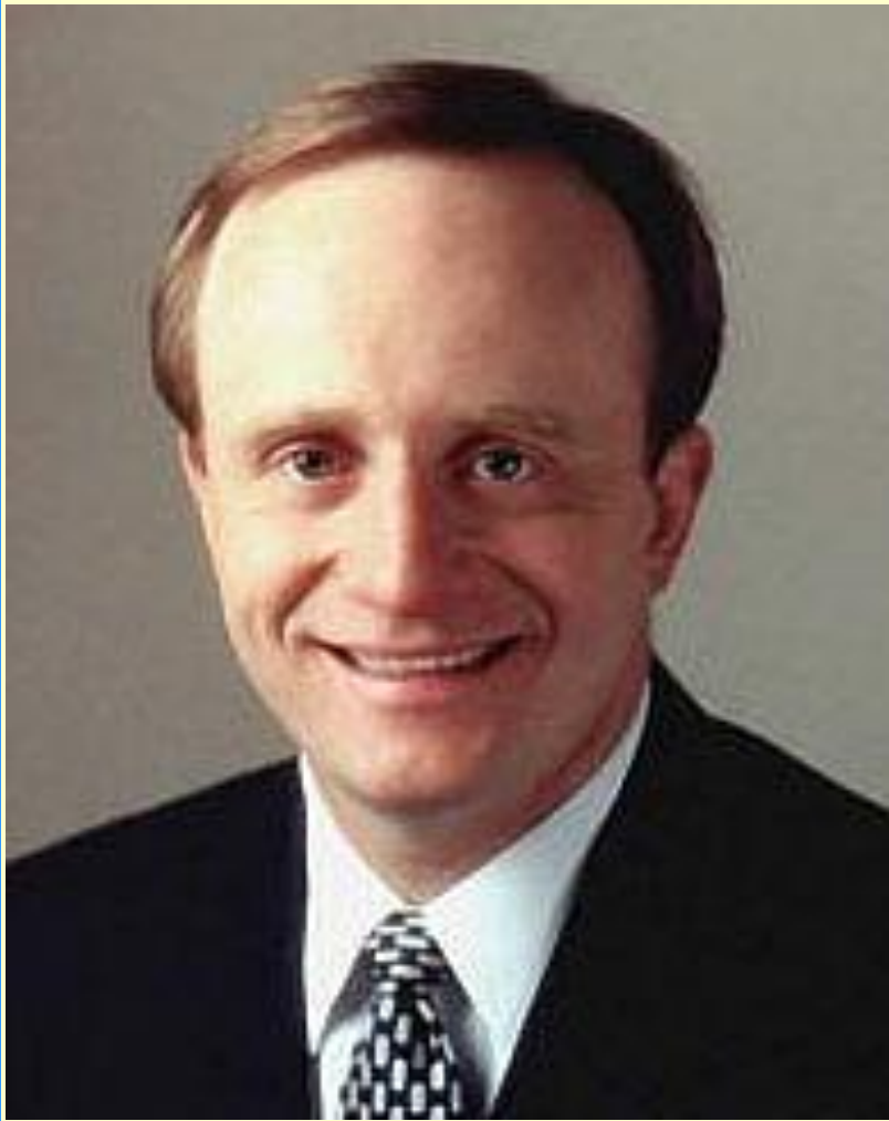
Paul Begala, liberal rasp