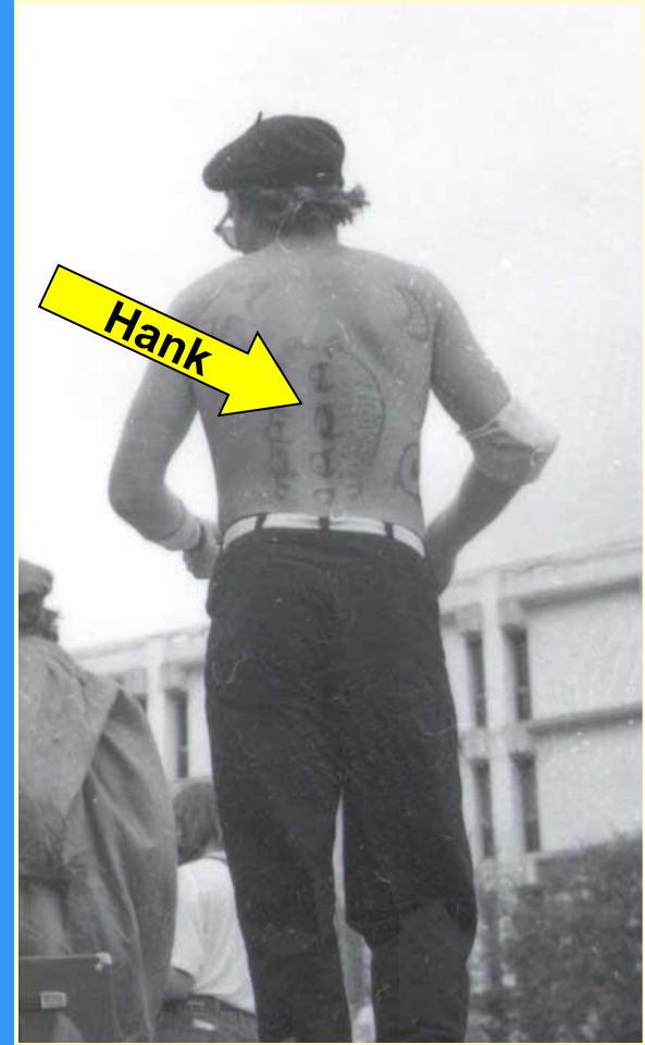
Dreaming The Dream