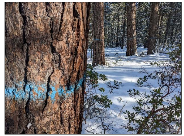
Ponderosa pine in the project area

The project location is outside the Bend city limits, but within the city limits. The Tree Preservation Performance Standards (16.10.100) require that all trees with a diameter at breast height (DBH) of twelve (12) inches or larger be retained on site, and 50% of all trees between eight (8) and twelve (12) inches DBH "shall" be retained on site. This standard suggests a high social value of mature and large trees to the citizens of Bend and central Oregon. The tract within the Phil's trail network is not legally inside the city limits, but the city as a stakeholder in the collaboration should take a strong position on protecting larger trees that is consistent with its own standards.